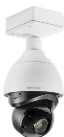
Shown with short pendant mount/back box

3MP PTZ with built-in IR and HDR technology