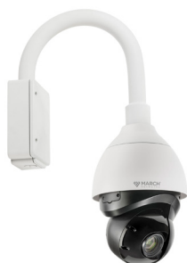
Shown with wall mount/back box